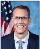
Representative Randy Feenstra