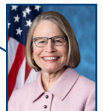
Representative Mariannette Miller-Meeks