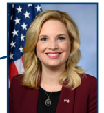
Representative Ashley Hinson