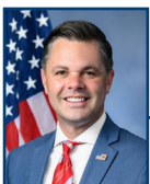
Representative Zach Nunn