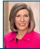
Senator Joni Ernst